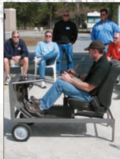
For our driving session, heel-and-toe shifting was addressed but not emphasized. They had this cool practice rig to help hone our skills on the short periods of time when we weren't on the track.

After two other sessions testing our shifting skills and threshold braking, we were headed for some track time with our instructors. Just outside of Savannah is a small track called Roebling Road. With broad, sweeping turns, this track is quite fast and you'll