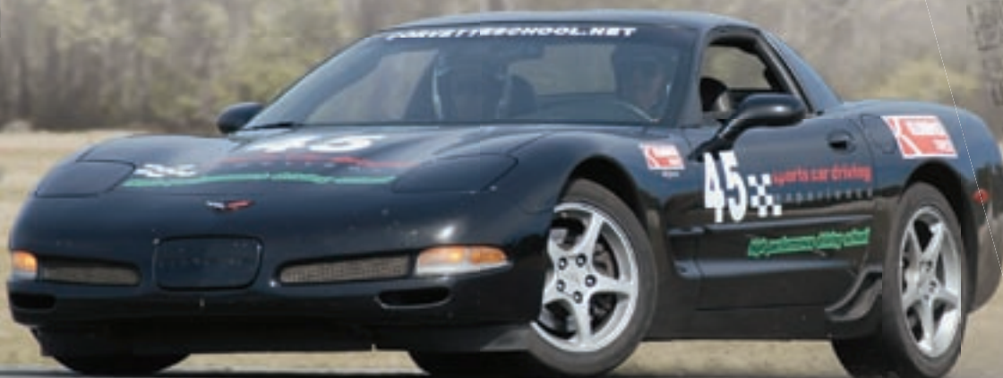
One of the more interesting exercises was the tight autocross. Students were prodded to increase their speed to get the feel of when the car loses grip and how to counteract it.